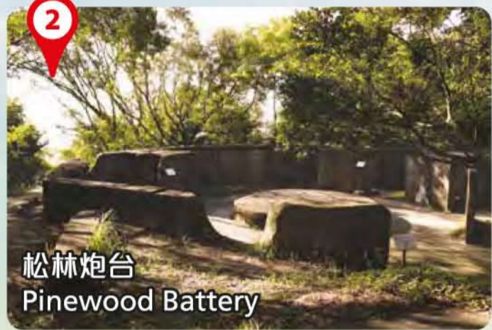
松林炮台 Pinewood Battery

位於克頓道的界石，與其他五塊界石標示出1903年港島維多利亞城的範圍，標誌著香港城市發展的歷史遺跡。 The boundary stone at Hatton Road, together with the other five boundary stones, marks out the boundaries of Victoria City in 1903 and reminds us Hong Kong's passage through time.