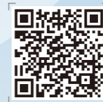
中西區區議會 Central and Western District Council