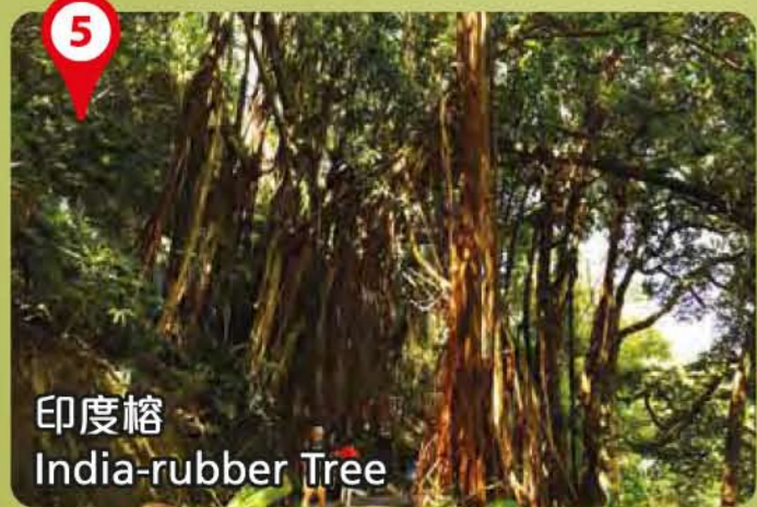
印度榕 India-rubber Tree

薄扶林水塘是香港首座儲水庫，亦是在山頂俯瞰港島南部其中一處最顯眼迷人的地方。 Pok Fu Lam Reservoir was the first reservoir of Hong Kong. It stands out among all the other features over the southern part of Hong Kong.