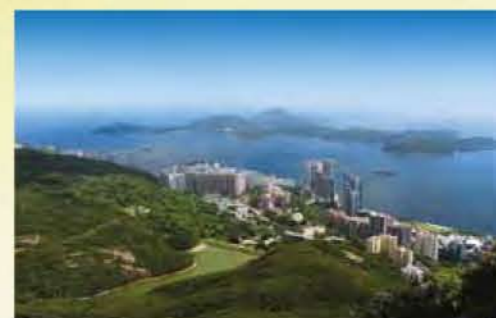
山頂遠眺薄扶林郊野公園的景色 View of Pok Fu Lam Country Park from the Peak

Designated in 1979, Pok Fu Lam Country Park is a 270-hectare sylvan sanctuary encompassing Victoria Peak and Pok Fu Lam Reservoir. Although small in size as comparing with other country parks, the park is surprisingly diverse in its magnificent view of landscapes and waterscapes formed by Pok Fu Lam Reservoir and the shade of green around, and in its utterly different scene formed by the wooded Victoria Peak and astounding cityscape of Victoria Harbour underneath. Strolling through the park, you are greeted by beautiful landscape of hills and waters.