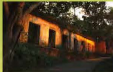
松林炮台附近掩蔽體遺跡 Battery building relics near Pinewood Battery

龍虎山郊野公園於1998年劃定，面積只有47公頃，是全港面積最小的郊野公園。公園位於西高山以北，旭龡道以南，東面以克頓道為界，南面為夏力道，西面及北面則以一條由水務署建造的暗渠為界。園內最大特色為松林炮台及堡壘等遺跡，而附近的龍虎山燒烤區內設有涼亭及燒烤爐。龍虎山郊野公園是香港其中一處結合自然生態及人文歷史的地方，讓遊客欣賞自然景色之餘，又可進一步了解香港的近代歷史。