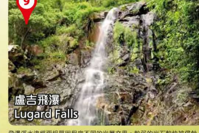
盧吉飛瀑 Lugard Falls

舊總督山頂別墅於1946年拆卸，只剩下原來的守衛室，現時被列為法定古蹟。 The Mountain Lodge was demolished in 1946, leaving only Gate Lodge. The Gate Lodge is now a declared monument.