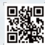
爐峰自然步道 The Peak Trail