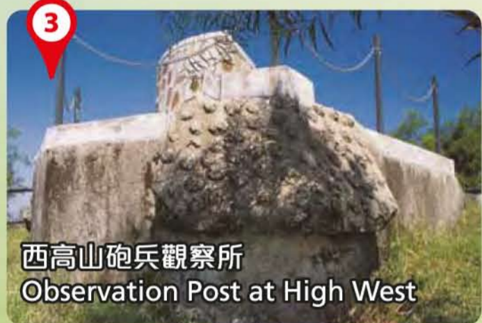
西高山砲兵觀察所 Observation Post at High West

位於龍虎山的松林炮台，是香港唯一一座以戰前型制遺留下來的空防炮台。四周的戰爭痕跡，成為香港保衛戰的印記。 Located at the hillside of Lung Fu Shan, the Pinewood Battery, the only anti-aircraft battery in Hong Kong, still displays a pre-war layout.