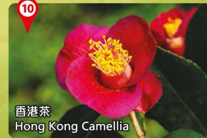
香港茶 Hong Kong Camellia

飛瀑溪水經兩組堅固程度不同的岩層交界，較弱的岩石較快被侵蝕，形成陡崖。流水經過陡峭的地形傾瀉而下，形成盧吉飛瀑。 Water of Lugard Falls flows over the junction of two segments with different strength of tuff layers. Cliffs are formed by weaker layers where erosion occurs at a faster rate. Lugard Falls is therefore formed as water falls down the steep terrain.