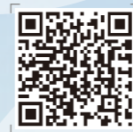
漁農自然護理署 Agriculture, Fisheries and Conservation Department