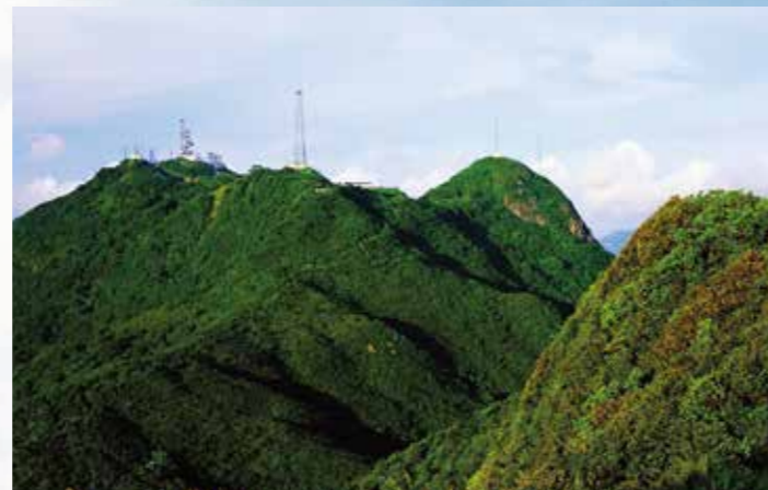
太平山頂 The Victoria Peak

為協助發展旅遊業，以及加強區內居民對本區的認識和歸屬感，中西區區議會聯同漁農自然護理署及中西區民政事務處於2002年推出「中西區生態教育徑」——爐峰自然步道，讓市民及遊客在遊覽這一區時，可以認識到這區的自然景觀、花鳥蟲魚及歷史文化。