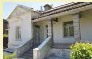
二級歷史建築的薄扶林郊野公園管理站 Grade II Historic Building - The Pok Fu Lam Country Park Management Centre

薄扶林郊野公園在1979年成立，面積達270公頃，由環繞薄扶林水塘及太平山的土地組成。此公園面積雖小，但擁有美不勝收的自然環境：薄扶林水塘水平如鏡，與四周翠綠林蔭交織出一片壯麗優美的湖光山色；太平山林木茂盛，與山下維港綽約風姿相映成一幅令人驚嘆的都會風光。遊園漫步，舉目四望，別有一番風味。