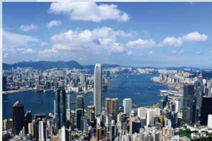
盧吉道遠眺維多利亞港的景色 View of Victoria Harbour from Lugard Road

Probably you have visited the Peak before. But, with this leaflet, we hope you will realise that there are many more interesting ecological, historical and cultural features at the Peak for your further exploration.