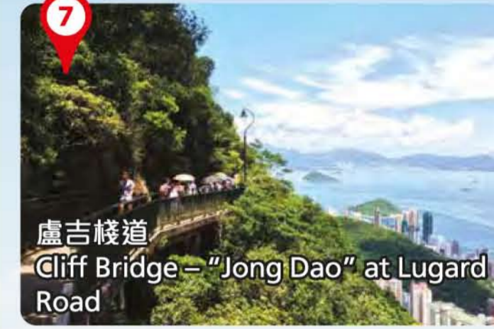
盧吉棧道 Cliff Bridge - "Jong Dao" at Lugard Road

樟樹是為香港常綠喬木，可用來製造高級家具及箱櫃，或作造船及建築材料之用。 Camphor Trees are evergreen trees in Hong Kong and are good quality materials for premium furniture and chests, and can be used in shipbuilding and construction.