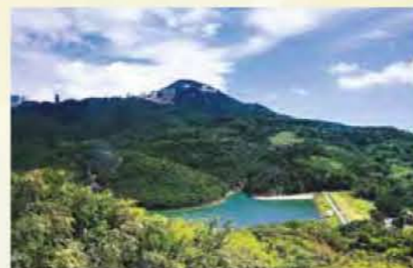
薄扶林水塘 Pok Fu Lam Reservoir

Designated in 1979, Pok Fu Lam Country Park is a 270-hectare sylvan sanctuary encompassing Victoria Peak and Pok Fu Lam Reservoir. Although small in size as comparing with other country parks, the park is surprisingly diverse in its magnificent view of landscapes and waterscapes formed by Pok Fu Lam Reservoir and the shade of green around, and in its utterly different scene formed by the wooded Victoria Peak and astounding cityscape of Victoria Harbour underneath. Strolling through the park, you are greeted by beautiful landscape of hills and waters.