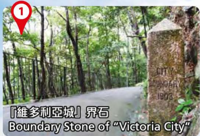
『維多利亞城』界石 Boundary Stone of "Victoria City"

位於克頓道的界石，與其他五塊界石標示出1903年港島維多利亞城的範圍，標誌著香港城市發展的歷史遺跡。 The boundary stone at Hatton Road, together with the other five boundary stones, marks out the boundaries of Victoria City in 1903 and reminds us Hong Kong's passage through time.