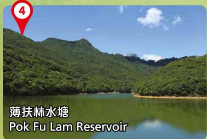
薄扶林水塘 Pok Fu Lam Reservoir

位於西高山的砲兵觀察所，是一座外觀仍保存良好的戰時觀察所。 The observation post located at High West is still in fairly good condition to show its original appearance.