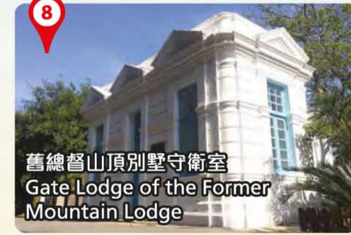
舊總督山頂別墅守衛室 Gate Lodge of the Former Mountain Lodge

建於1913至1914年間的盧吉道，是香港唯一的棧道，亦是欣賞維港都會風光的絕佳觀光徑。 Built between 1913 and 1914, the "Jong Dao" at Lugard Road was the only one cliff bridge in Hong Kong and allow people to enjoy the most beautiful cityscape of Victoria Harbour.