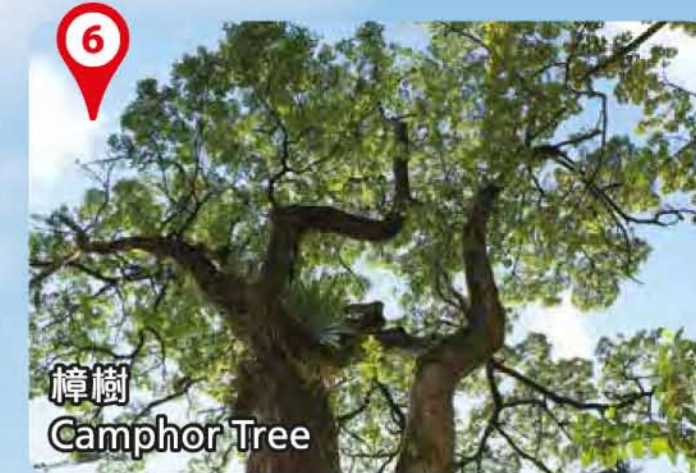
樟樹 Camphor Tree

樟樹是為香港常綠喬木，可用來製造高級家具及箱櫃，或作造船及建築材料之用。 Camphor Trees are evergreen trees in Hong Kong and are good quality materials for premium furniture and chests, and can be used in shipbuilding and construction.