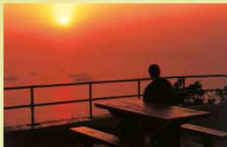
夏力道西端郊遊場地的日落景觀 A sunset view from the Picnic Site at the western end of Harlech Road

Designated in 1998, Lung Fu Shan Country Park is the smallest country park in Hong Kong covering 47 hectares. Situated north of High West and south of Kotewall Road, its borders lie on Hatton Road in the east and Harlech Road in the south, while the west and north boundaries are marked by drains laid by the Water Supplies Department. War relics are major highlights of the park. Pinewood Battery and remains of old forts provide perfect setting for a journey back in time. A rain shelter and barbecue pits can be found in the Lung Fu Shan Barbecue Area nearby. Lung Fu Shan is a place having history in Hong Kong which allows visitors to enjoy the natural beauty and to explore the Hong Kong's modern history in one visit.