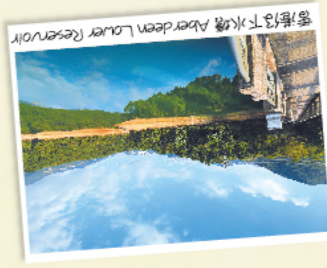
香港仔下水塘 Aberdeen Lower Reservoir

The Aberdeen Country Park covers a wide domain of southern uplands and valleys. The Aberdeen Upper Reservoir and the Aberdeen Lower Reservoir here are the youngest reservoirs built on Hong Kong Island. You cannot help marvelling at the grand reservoirs and dams and the flocks of black kites hovering over the valley.