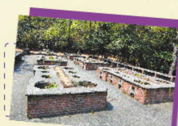
野外爐灶遺址 Outdoor stoves

The two outdoor stoves in the Tai Tam (Quarry Bay extension) Country Park were built during 1938 to 1939 for cooking food in the time of war. In addition to the stoves, there are some other relics nearby such as food depots and caves which might have been used for hiding.