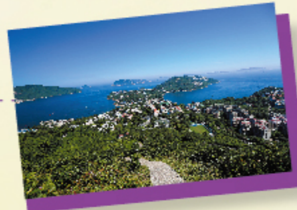
赤柱及春坎角 Stanley and Chung Hom Kok

The Twins consists of two peaks, namely, the South Twin and the North Twin. At the summit of the South Twin, we can get a 270-degree view of Stanley and Chung Hom Kok in the southern district of Hong Kong, Mount Parker in the north and further Tseung Kwan O. Even if there is a 1000-step "stairs" before them, hiking lovers are still full of enthusiasm.