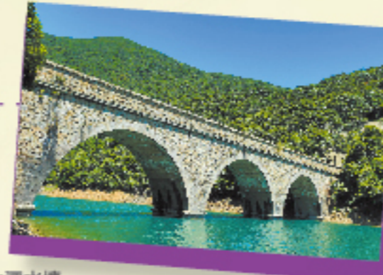
大潭水塘 Tai Tam Reservoir

大潭水塘是第二次世界大戰前興建的水務設施，水塘內有22項屬法定古蹟的水務歷史建築群，當中有梯級設計的水壩和花崗石拱端托的石橋，氣勢磅礴，屬拍攝熱點。大自然的鬼斧神工加上建築師的匠心獨運，締造了一湖澄碧的絕色美景。