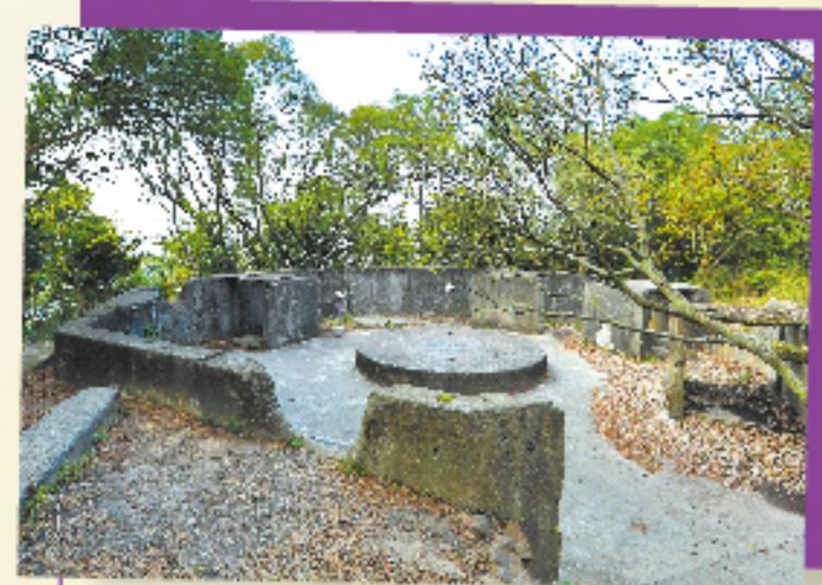
松林炮台 Pinewood Battery

Situated on Lung Fu Shan, the Pinewood Battery is the only existing anti-aircraft battery built before the war in Hong Kong. With war legacies around, it has become a mark of the Battle of Hong Kong.