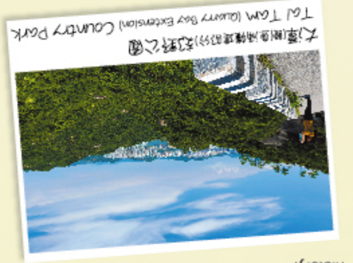
大潭(鯉魚灣擴建部分)郊野公園 Tai Tam (Quarry Bay Extension) Country Park

attracting overseas tourists to pay a visit to the place. Shan and Shek O Peak, is the jewel in the crown, undulating ridgetop trail between Wan Cham and Shek O Peak. The Dragon's Back, an popular hiking destinations, including Pottinger Island, the Shek O Country Park is filled with