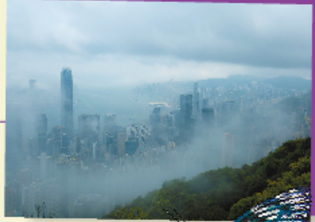
盧吉棧道 Lugard Road

位於太平山山頂的盧吉道，環繞鐘峰峽而行，是香港唯一依山而建的棧道，亦是欣賞維港都會風光的絕佳觀光徑。步道沿途設有傳意牌，介紹山頂的動植物、自然生態及歷史文化，是遊覽港島區郊野公園必到的景點。