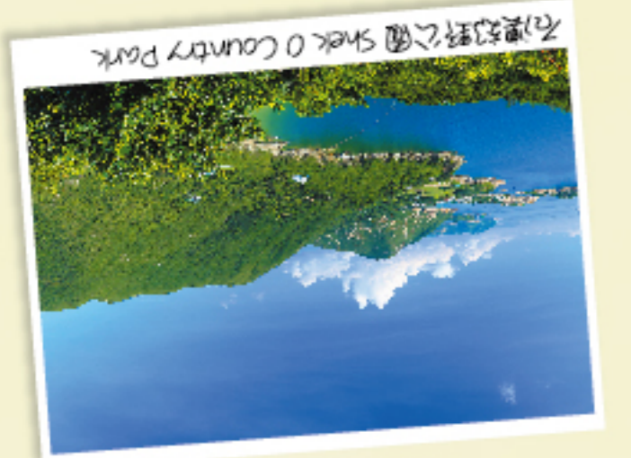
石澳郊野公園 Shek O Country Park

history. The country park lies on the northern edge of the Tai Tam Country Park. Standing on the top of Mount Parker, you can overlook the graceful Victoria Harbour. In foggy days of spring, the top of Mount Parker offers the best view of sea