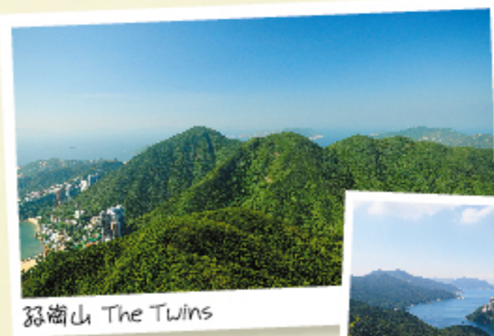
孖崗山 The Twins

港島的郊野公園可說是自然美景與都會風光對比最鮮明的郊野公園，只要站在一個較高位置俯視四周，便能看到翠綠郊野與繁華都會共冶一爐的獨特景致。公園內群峰巍峨而立，水塘怡神悅目，樹林蒼翠宜人，旖旎風光令人讚嘆不已，其中山頂、龍脊、大浪灣更是享譽盛名的郊遊景點。公園還有久遠的水塘建築、戰爭和歲月痕跡，細說出香港百多年的歷史故事，讓人懷古細味，尋幽探秘。