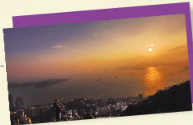
日落西高山 Sunset View at High West

高493米的西高山位於薄扶林郊野公園，從西面觀看此山外型似金字塔。山頂的觀景台可俯瞰整個香港島西面及南面海域錯落有致的島嶼，黃昏時，夕陽西下的迷人景致讓人陶醉不已。