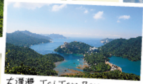
大潭灣 Tai Tam Bay