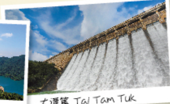
大潭篤 Tai Tam Tuk

About 40% land of Hong Kong Island has been designated as country parks; in particular, the Aberdeen Country Park and the Tai Tam Country Park, designated in 1977, are the oldest country parks. The 50-kilometre Hong Kong Trail passes through five country parks on Hong Kong Island from west to east.