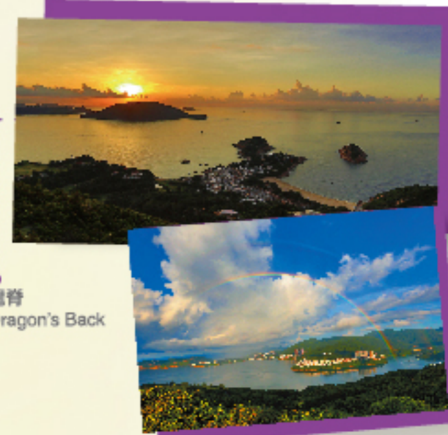
龍脊 Dragon's Back

"Dragon's Back" at Hong Kong Trail Section 8 was once selected as one of "the Best Urban Hike" in Asia. When viewed from afar, the mountain trail looks like the bone ridge of a dragon lying prostrate on the ground, hence the name "Dragon's Back". Standing high on the mountain trail, we can enjoy the breathtaking view of Shek O, Big Wave Bay and even Tung Lung Chau, Stanley and Tai Tam.