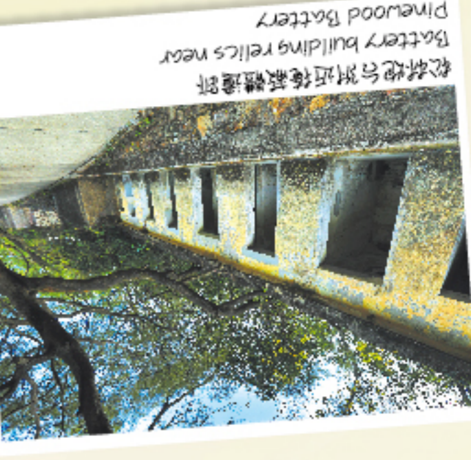
松林炮台附近殘骸遺跡 Pinewood Battery

The Lung Fu Shan Country Park is the smallest country park in Hong Kong. Hidden in the dense forests are the Pinewood Battery, remains of old forts and other war ruins, enabling visitors to learn more about Hong Kong's history while enjoying the beauty of nature.