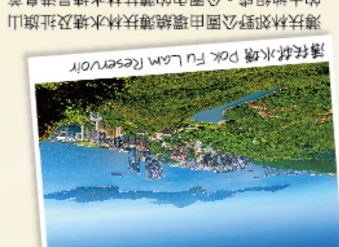
薄扶林水塘 Pok Fu Lam Reservoir

薄扶林郊野公園由環繞薄扶林水塘及扯旗山土地組成。公園內的薄扶林水塘是港島首個興建的水塘，與四周翠綠林蔭交織出一片壯麗優美的湖光山色。扯旗山是香港著名的旅遊區，林木茂盛，與山下維港綿約風姿相映成一幅令人驚嘆的都魯風光。